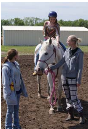
Photos from previous Family Fun Day at Hope in the Valley

AMBUCS members will grill hamburgers and serve lunch for attendees. Plan to bring your family and join in the fun!