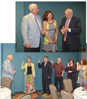
Photos from 2015 Banquet

Plan to be present for this festive event!